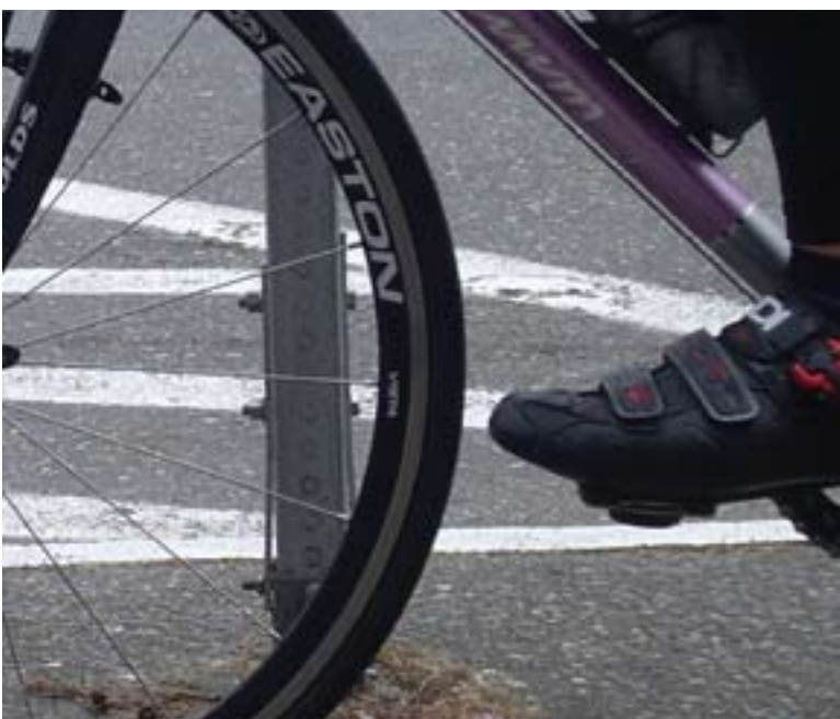
Example of no 'toe overlap' on a small bike that uses 650c wheels