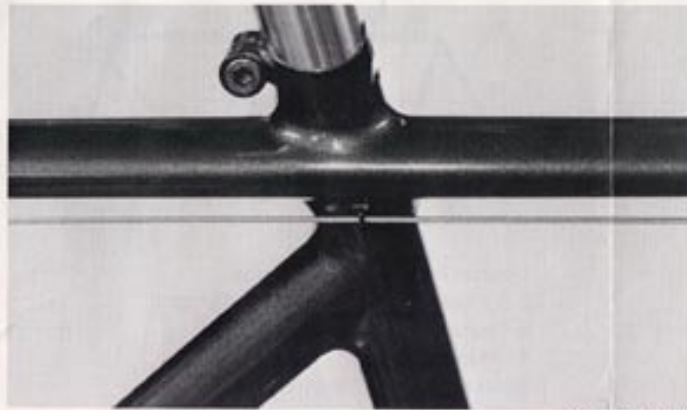
Oval Top Tube

Each Rodriguez tandem is unique . . . designed and crafted to meet your needs